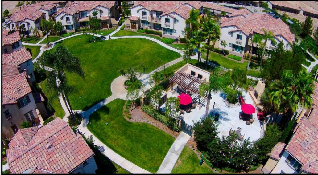
Villas at the Park, a luxury apartment community in Camarillo, CA purchased in March, 2015.

Ventura Investment Co. is a real estate investment firm founded in 1958, and based in Ventura County.