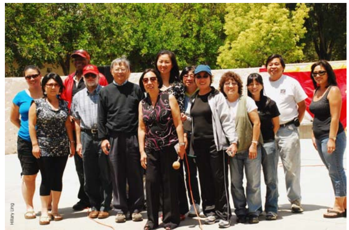
To wrap up, numerous prizes were raffled out.